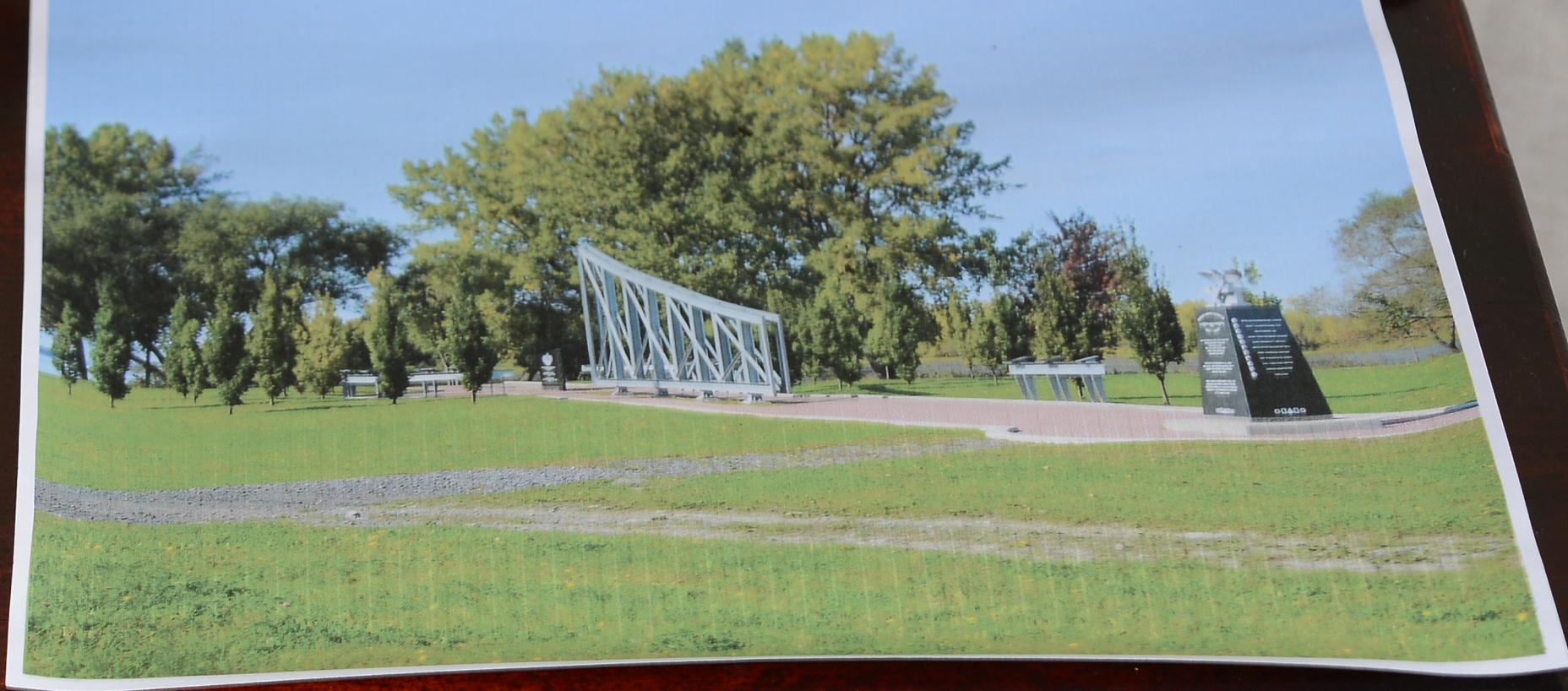
QUEBEC BRIDGE MEMORIAL